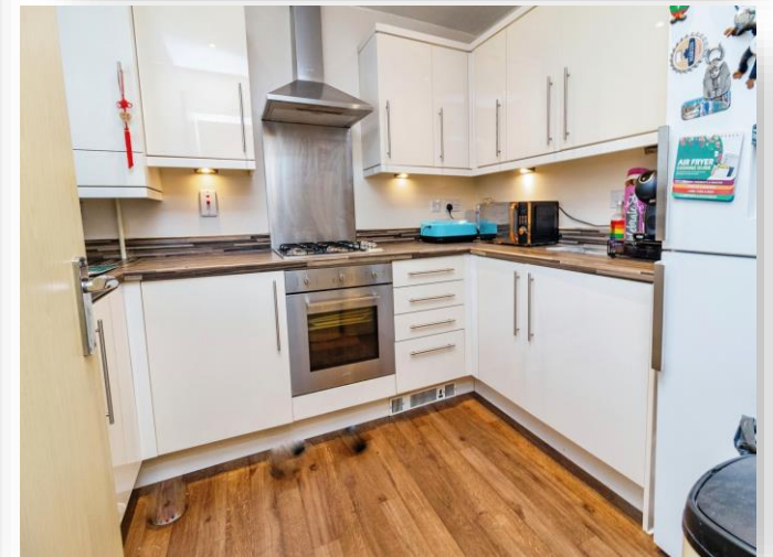
Grove Corner, Redhouse Park MILTON KEYNES MK14 5FA