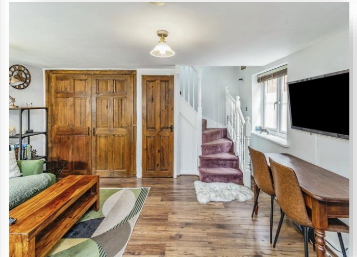
Cannon Court Union Street, Newport Pagnell MK16 8ET