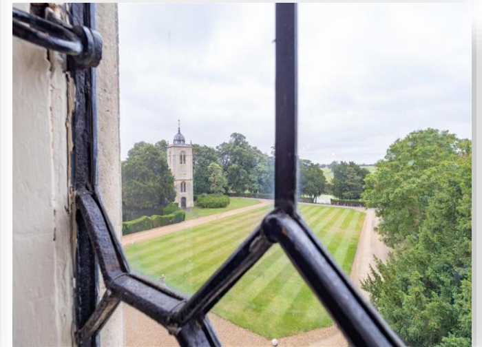
Gayhurst House Gayhurst Court, Gayhurst Newport Pagnell MK16 8LG