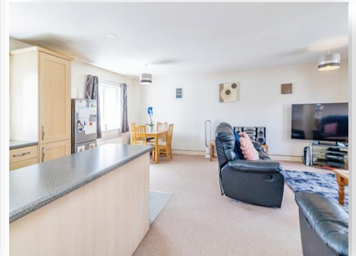
Cape End, Redhouse Park Milton Keynes MK14 5FE