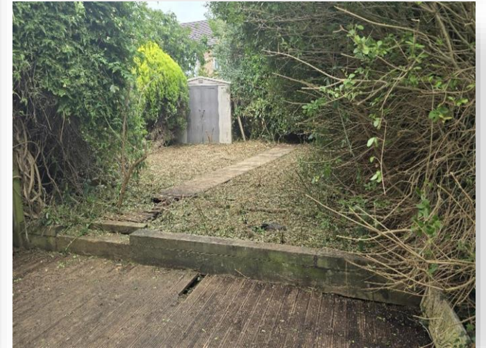
Stour Close, Newport Pagnell MK16 9DZ