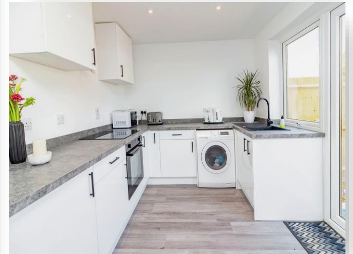
Holland Way, Newport Pagnell MK16 0LW