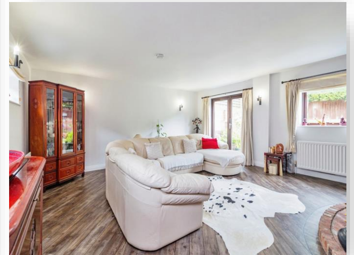
Waterhouse Close, Newport Pagnell MK16 0EL