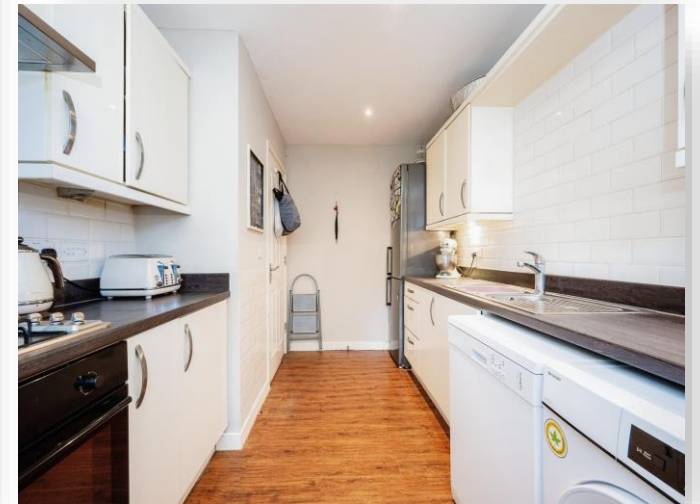
Sheep Way, Redhouse Park MILTON KEYNES MK14 5FP