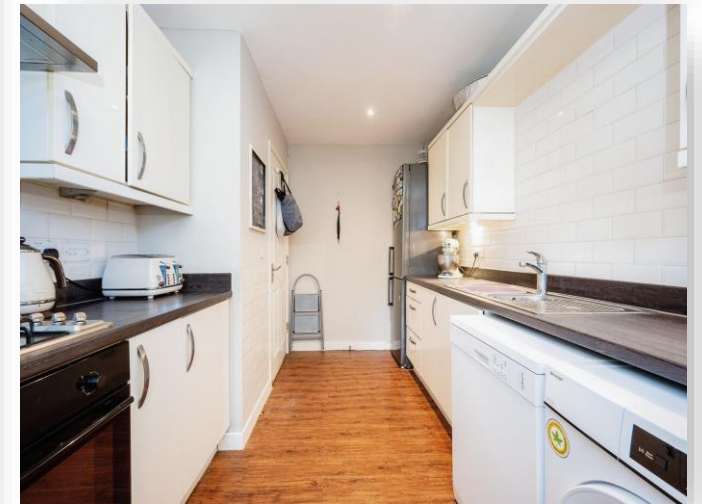
Sheep Way, Redhouse Park MILTON KEYNES MK14 5FP