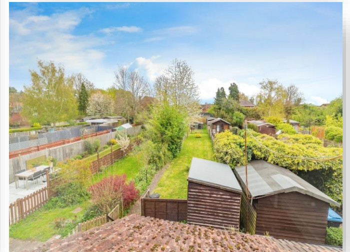
Station Terrace, Great Linford Milton Keynes MK14 5AP