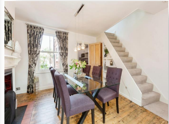
Beaconsfield Place, Newport Pagnell MK16 0EB