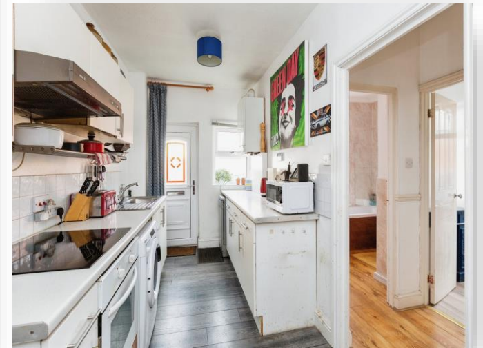
Flat A High Street, Newport Pagnell MK16 8EH