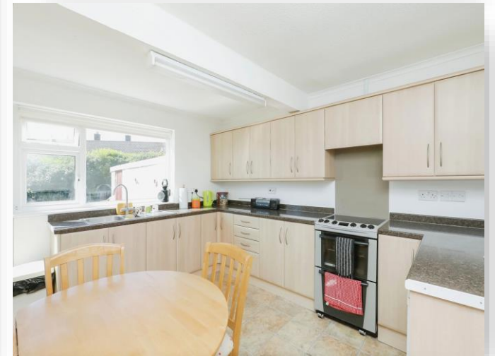
Back Lane, Mattishall, Dereham, NR20 3QX