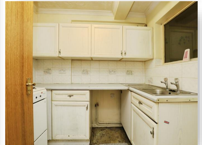
The Maltings, Dereham, NR19 2UU