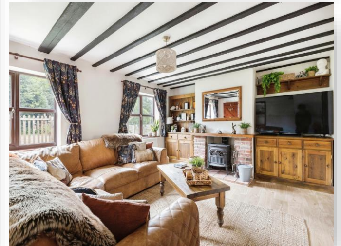
Church Cottages, Thuxton, Norwich, NR9 4QJ