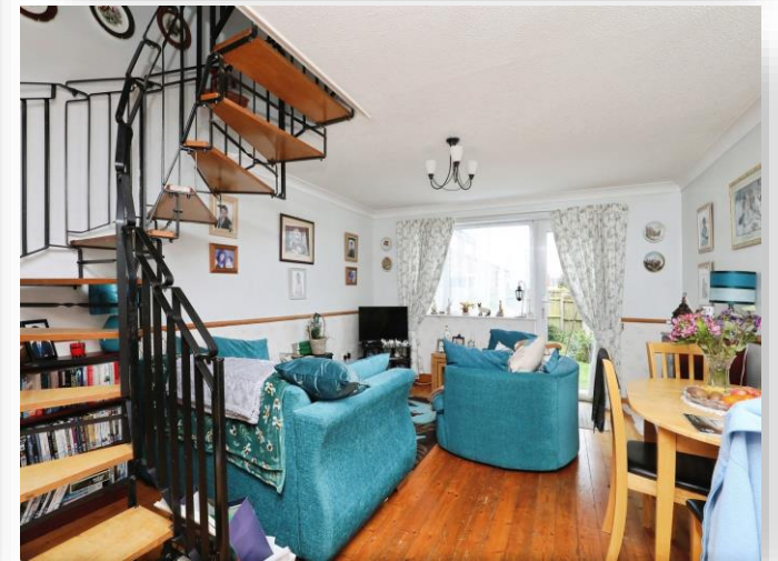
Burns Close, Dereham, NR19 2SE