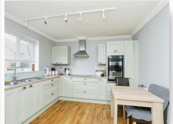
The Glebe, Hockering, Dereham, NR20 3TX