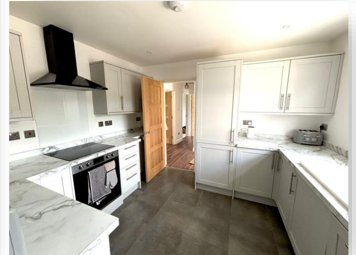
Letton Close, Shipdham, Thetford, IP25 7NS