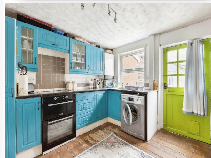
St. Nicholas Street, Dereham, NR19 2BS