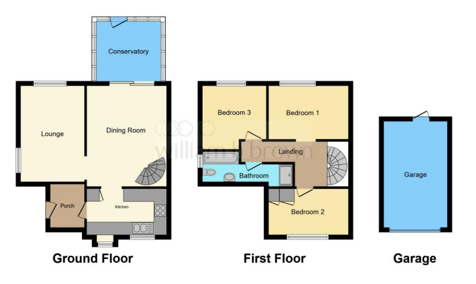
This floor plan is for illustrative purposes only. It is not drawn to scale. Any measurements, floor areas (including any total floor area), openings and orientation are approximate. No details are guaranteed, they cannot be relied upon for any purpose and they do not form part of any agreement. No liability is taken for any error, omission or misstatement. A party must rely upon its own inspection(s). Powered by www.focalagent.com