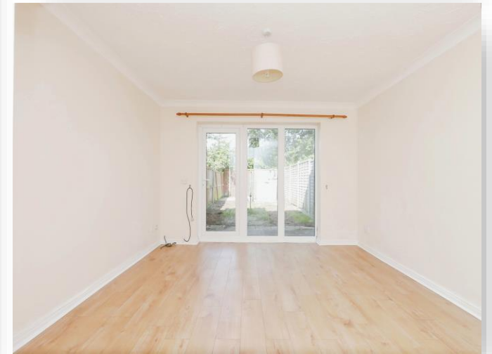
Farrow Close, Mattishall, Dereham, NR20 3SZ