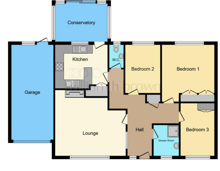
This floor plan is for illustrative purposes only. It is not drawn to scale. Any measurements, floor areas (including any total floor area), openings and orientation are approximate. No details are guaranteed, they cannot be relied upon for any purpose and they do not form part of any agreement. No liability is taken for any error, omission or misstatement. A party must rely upon its own inspection(s). Powered by www.focalagent.com