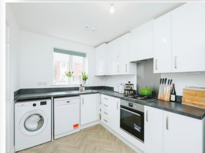
Caddow Close, Dereham, NR19 1JF