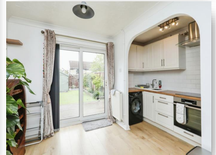
Grove Close, Scarning, Dereham, NR19 2TE