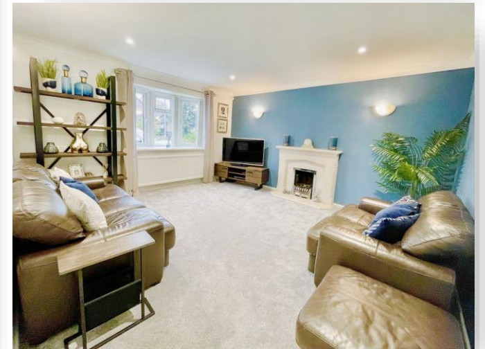
Farrow Close, Swanton Morley, Dereham, NR20 4RN