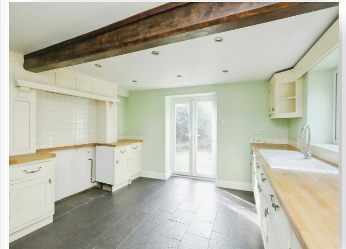
London Street, Whissonsett, Dereham, NR20 5ST