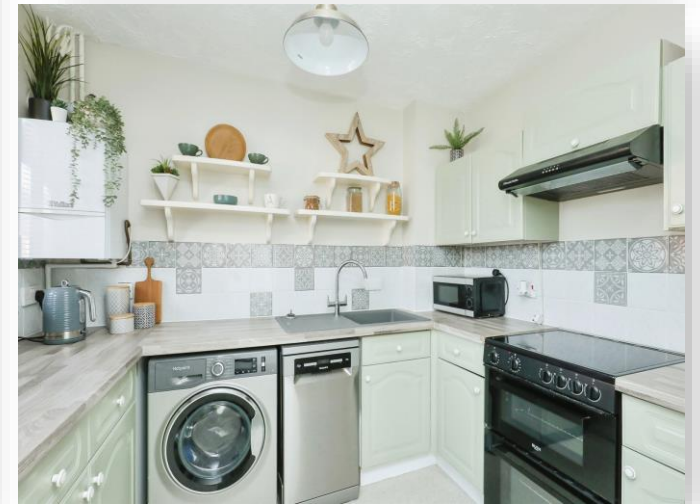
Rome Walk, Dereham, NR19 1XJ