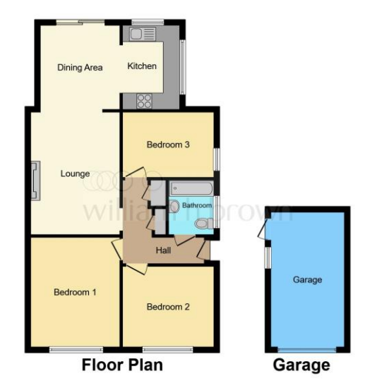
This floor plan is for illustrative purposes only. It is not drawn to scale. Any measurements, floor areas (including any total floor area), openings and orientation are approximate. No details are guaranteed, they cannot be relied upon for any purpose and they do not form part of any agreement. No liability is taken for any error, omission or misstatement. A party must rely upon its own inspections(s). Powered by www.localagent.