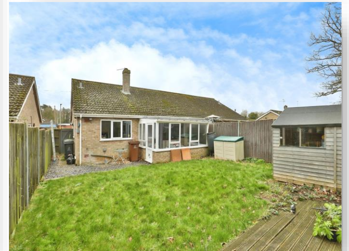
South Green Gardens, Dereham, NR19 1PY