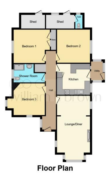
This floorplan is for illustrative purposes only and is not drawn to scale. Measurements, floor-areas, openings and orientations are approximate. They should not be relied upon for an purpose and do not form any part of an agreement. No liability is taken for any error or mis-statement. All parties must rely on their own inspections.