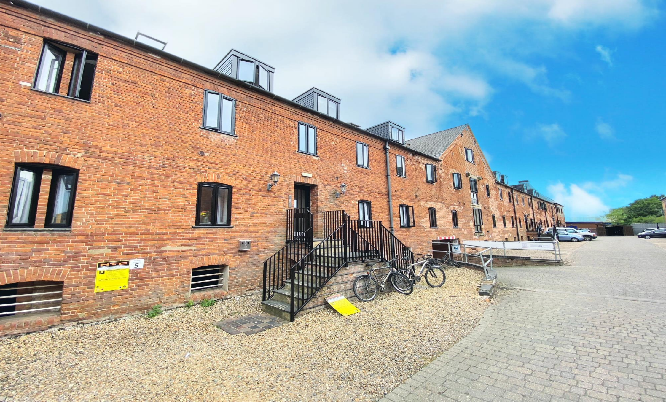
The Maltings, Dereham, NR19 2UH