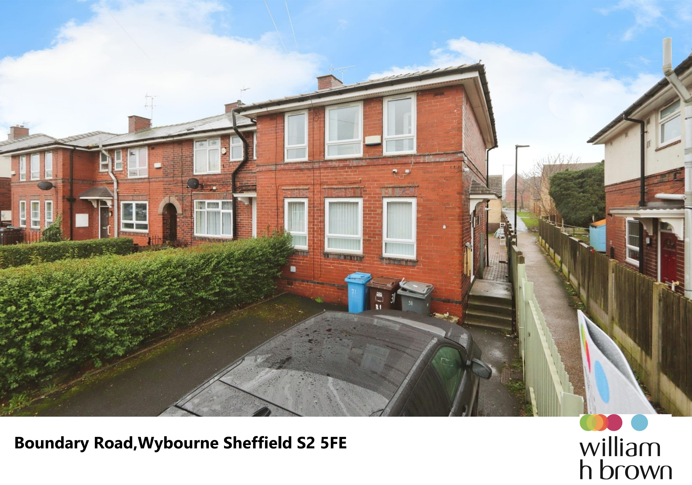
Boundary Road, Wybourne Sheffield S2 5FE