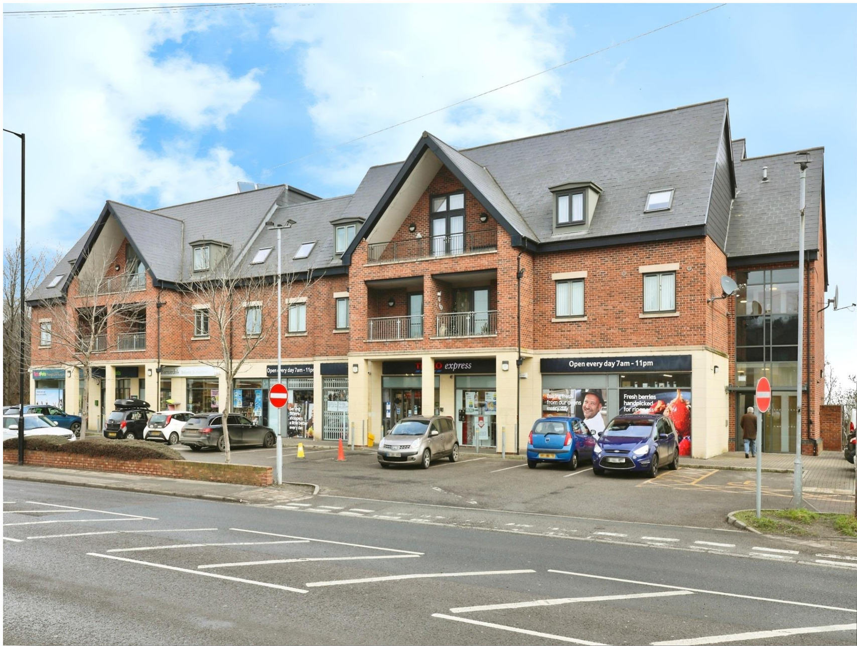
Birley Moor Heights Birley Moor Road,Sheffield S12 4WG