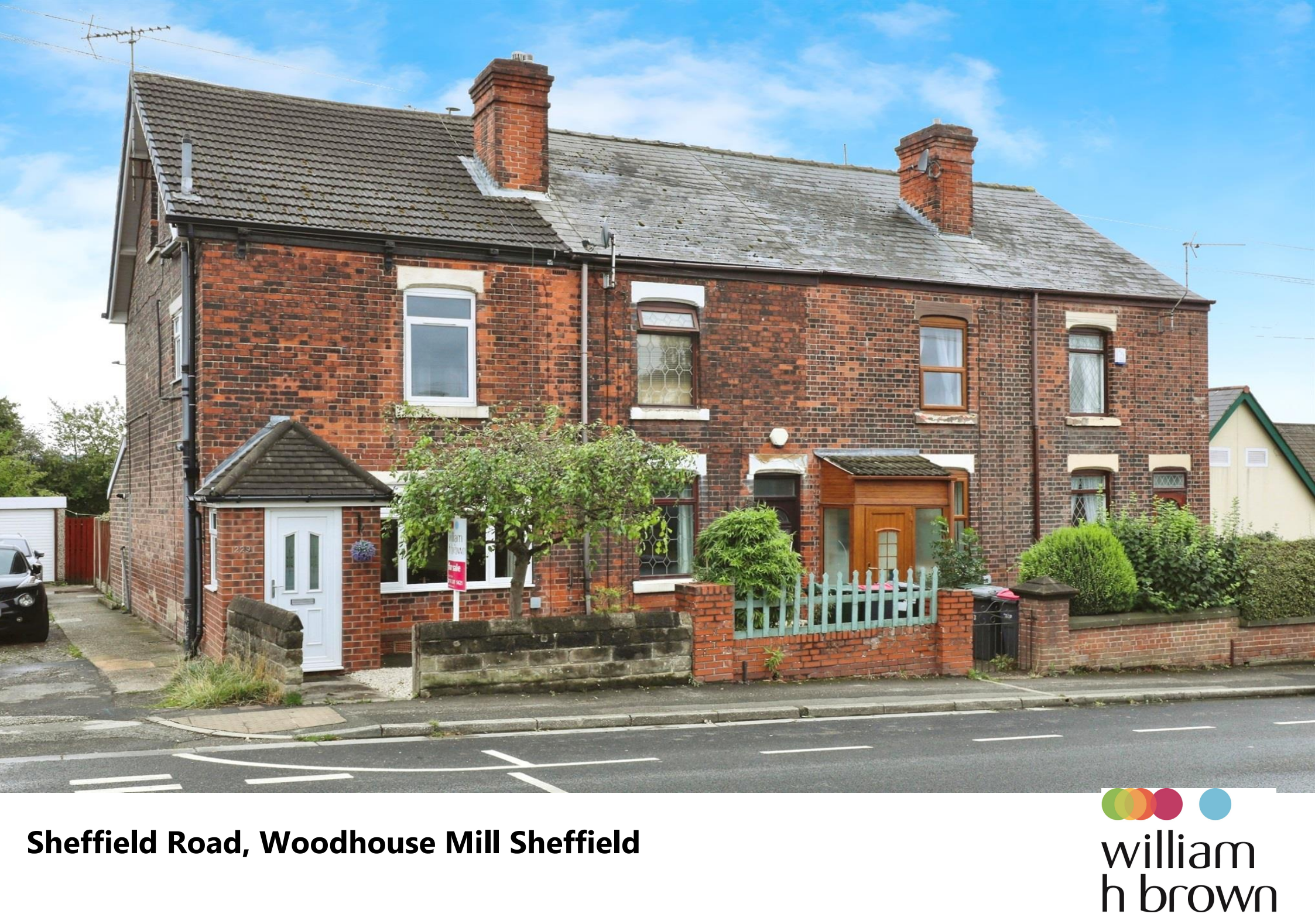
Sheffield Road, Woodhouse Mill Sheffield