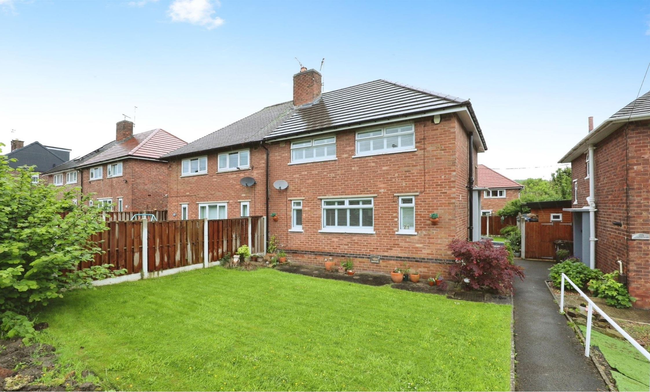
Rainbow Way, Hackenthorpe Sheffield