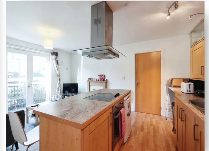
Oxclose Park Gardens, Halfway SHEFFIELD S20 8GR