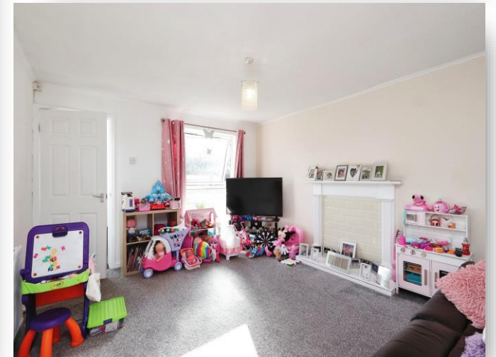
Thorpe Drive, Waterthorpe Sheffield S20 7JU