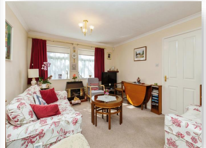
Pegasus Road, Leighton Buzzard, LU7 3NJ