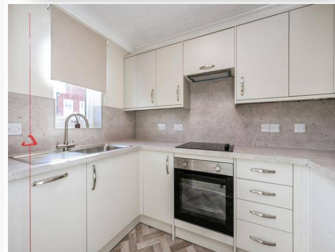
Hamilton Court, Lammas Walk, Leighton Buzzard, LU7 1JF