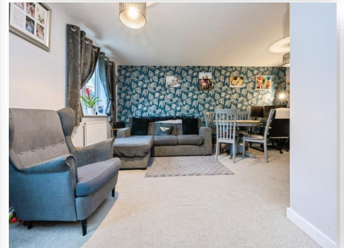
Puffin Place, Leighton Buzzard, LU7 4DZ