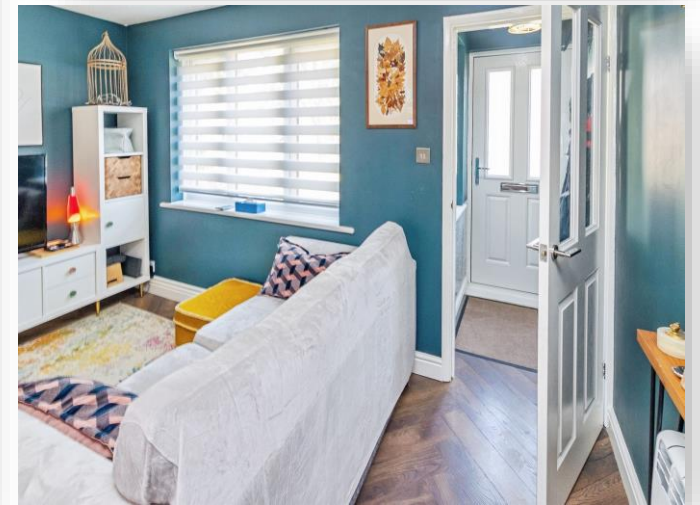
Church Hill, Cheddington Leighton Buzzard LU7 0SY