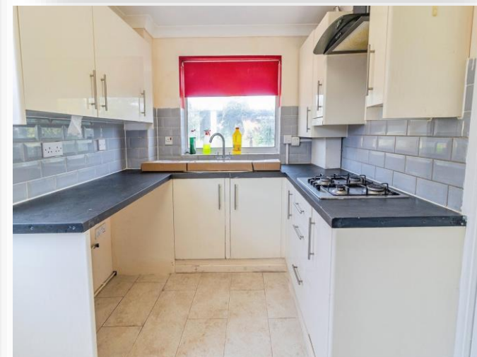
Kiteleys Green, Leighton Buzzard, LU7 3LD