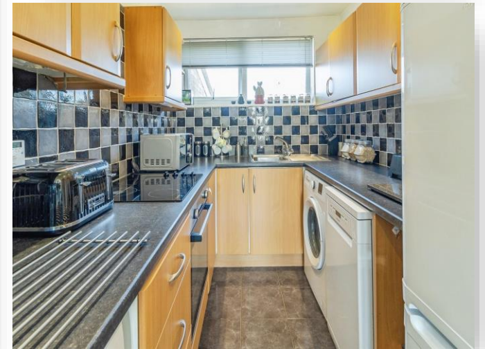
Dulverton Court, Bideford Green, Linslade, Leighton Buzzard, LU7 2UG