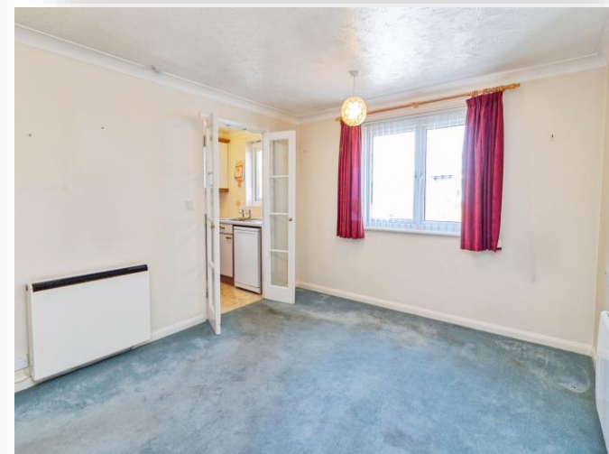
Hamilton Court, Lammas Walk, Leighton Buzzard, LU7 1JF