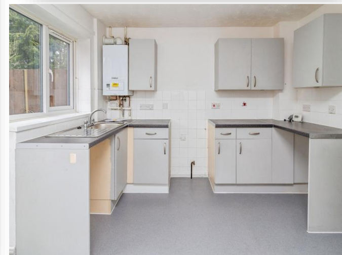
St. Georges Close, Leighton Buzzard, LU7 1ZX