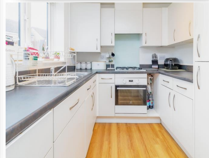
Siskin Grove, Leighton Buzzard, LU7 4DQ