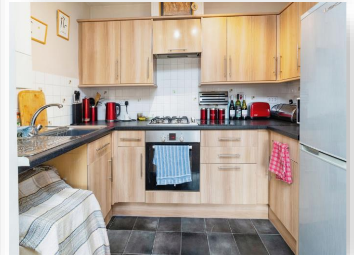
Corbet Ride, Linslade, Leighton Buzzard, LU7 2SJ