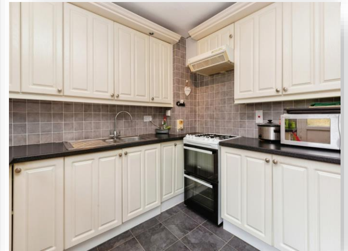
Riverside, Leighton Buzzard, LU7 3HX