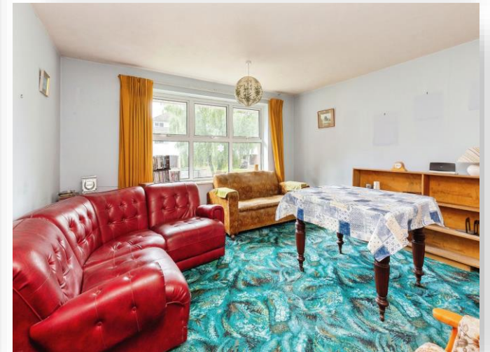
Grasmere Way, Linslade, Leighton Buzzard, LU7 2QL