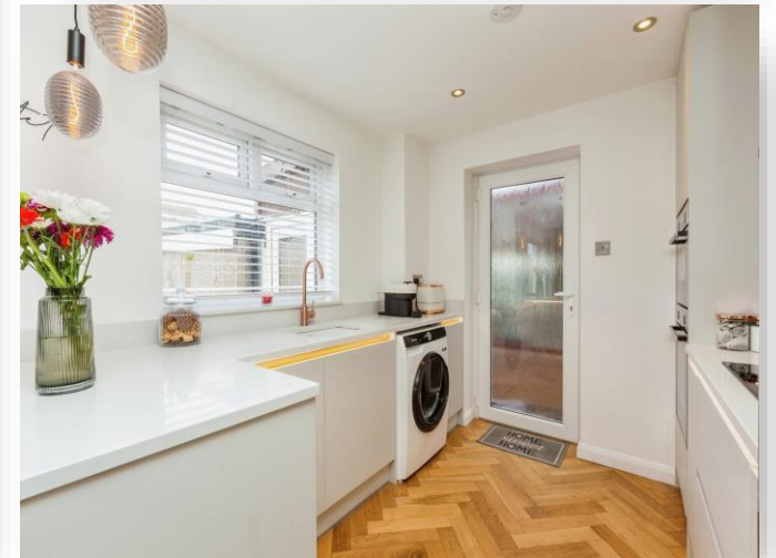
Brookside Walk, Leighton Buzzard, LU7 3LA